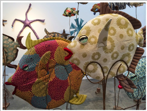
(I use my cell phone pictures throughout with the gallery's permission)

It's also fun. You simply cannot help but smile as you swim along with these fantasy creations. They sweep you out of the gloom of all those problems you bring in with you--whether personal, cultural, or political. And there's plenty of that going around. So do yourself a favor. Get delighted. Go swim with the fishes. You'll be glad you did.