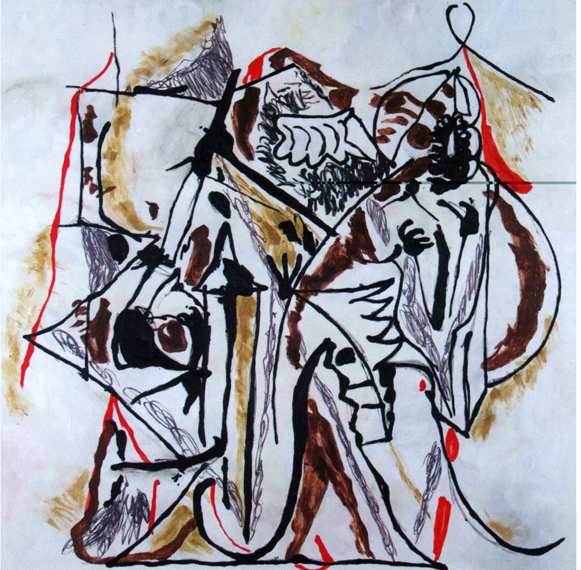
(ABOVE) SMASH YOUR HEAD ON THE PUNK ROCK , 2013, OIL ON CANVAS, 36 X 36 INCHES