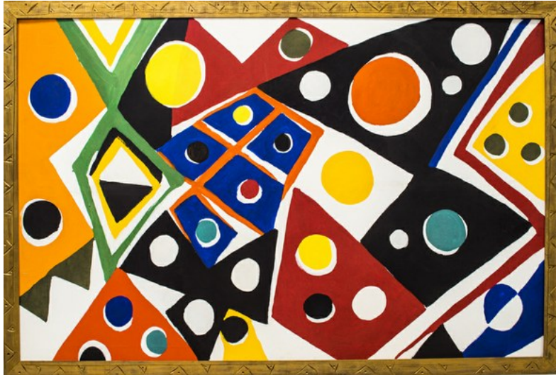
Kim MacConnel, "Timboctu," 1987 Cotton flocking and acrylic on canvas, 66 ½" x 103"

To inaugurate her light-filled, high-ceilinged space, Felsen shows the 1980's paintings of Encinitas-based painter Kim MacConnel. MacConnel is associated with a number of painters in a loose knit movement called Pattern and Decoration. Reacting against the reductive and decidedly masculine realm of Minimal and Conceptual art of the 1970's, these artists, male and female, turned to applied and outsider art, feminine and tribal sources for their inspiration.